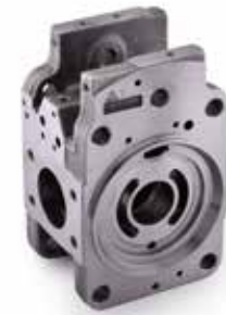
K3V63 VALVE BLOCK