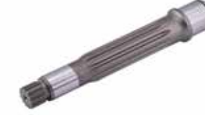
K5V200 DTH-R 10T