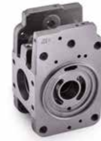
K3V112 VALVE BLOCK

HYDRAULIC VALVES ARE INTEGRAL PARTS OF HYDRAULIC POWER SYSTEMS. WE PROVIDE A WIDE RANGE OF VALVE BLOCKS AND VALVE CASING FOR YOUR CHOICE.