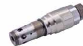
M5X130-180 RELIEF VALVE