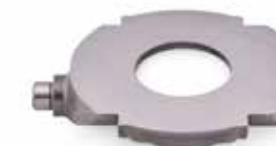
CAM ROCKER NEW