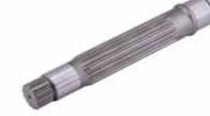
K3V180 DT-R JUNJIN