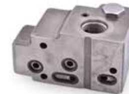
0032 VALVE CASING