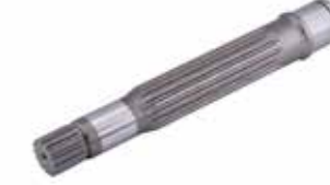
K5V200 DTH-R 13T