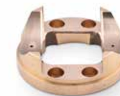
CRADLE W/O STOPPER