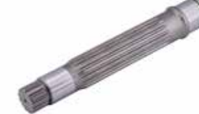
K3V180 DTH-R JUNJIN