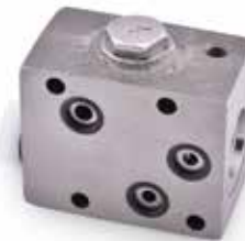
0168 VALVE CASING

HYDRAULIC VALVES ARE INTEGRAL PARTS OF HYDRAULIC POWER SYSTEMS. WE PROVIDE A WIDE RANGE OF VALVE BLOCKS AND VALVE CASING FOR YOUR CHOICE.