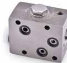
0089 VALVE CASING