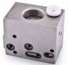
0012 VALVE CASING

IT IS ONE OF OUR MAIN PRODUCT LINES. ON THIS PAGE WE SHOW ONLY AN OVERVIEW OF REFERENCES OF THIS FAMILY.