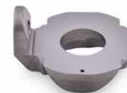
CAM ROCKER OLD